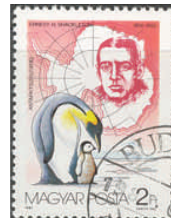
Hungary - Issued: 1987

Email sydneyyouthstampgroup@gmail.com Web site youth.stamparena.com