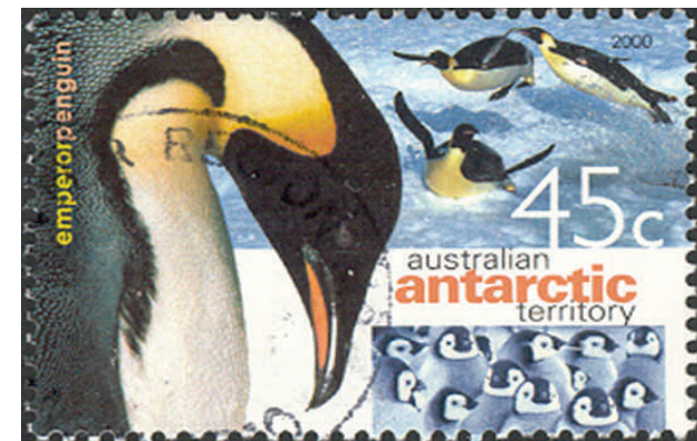
Australian Antarctic Territory - Issued: 24 July 2000